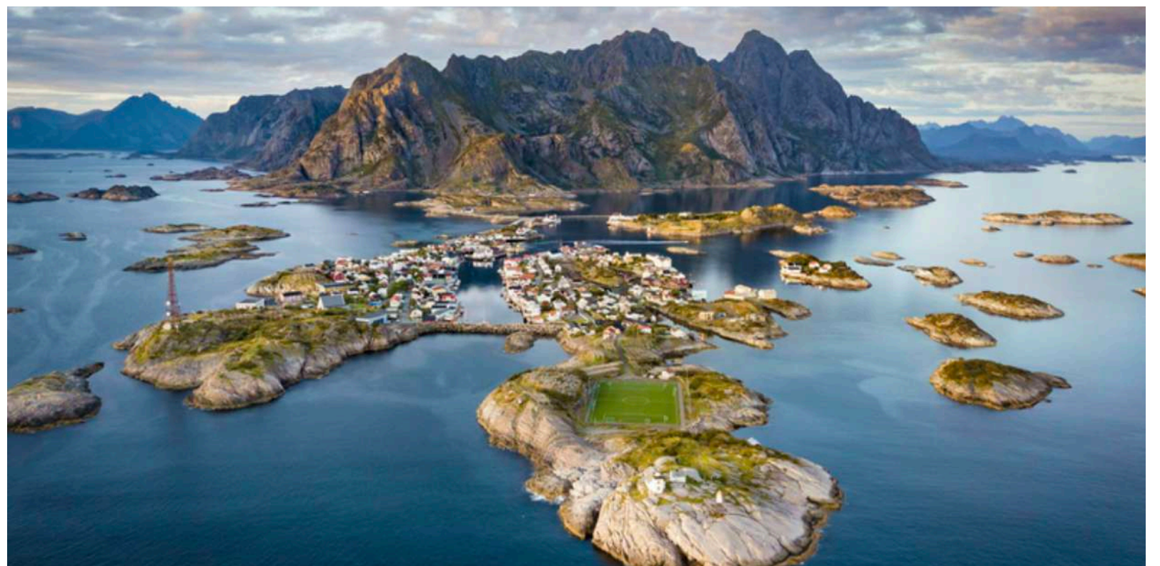
Pic : photo of Henningsvaer